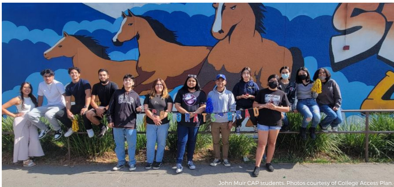
John Muir CAP students.