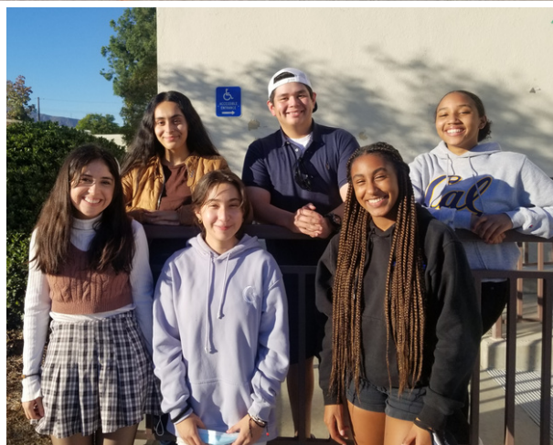
John Muir CAP students.

After spring break, we saw our largest and most consistent number of student participants. We noticed an increase in anxiety and discomfort in math and science, but Caltech tutors were ready to help.